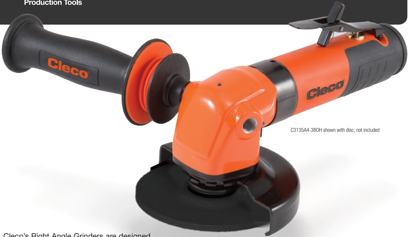
C3135A4-380H shown with disc, not included

Cleco's Right Angle Grinders are designed for rigorous use and long life, containing the features and power that are perfect for the most demanding applications found in foundries, shipyards, machine shops and rail car manufacturing.